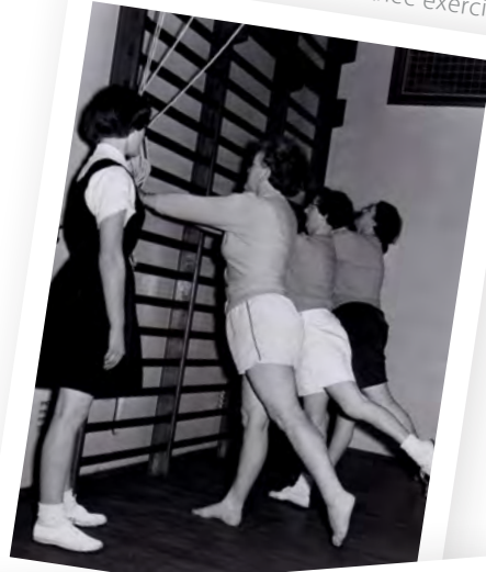
Hip or knee exercises