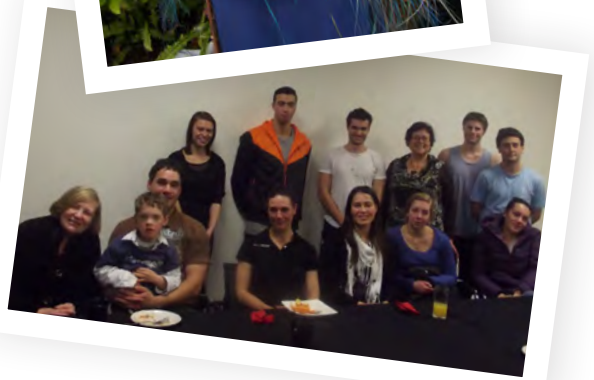
Kaitiaki and students at Otago